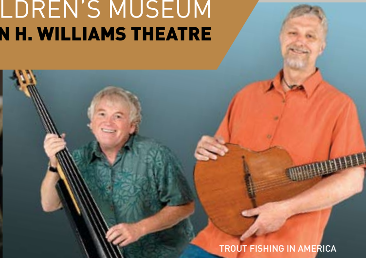
TROUT FISHING IN AMERICA

TROUT FISHING IN AMERICA September 20 This folk music duo uses an irreverent and plucky sense of humor to appeal to kids and adults alike with playful songs such as "My Hair Had a Party Last Night" and "What I Want is a Proper Cup of Coffee."